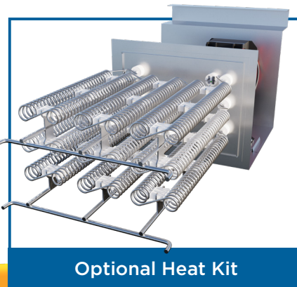
Optional Heat Kit